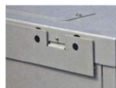
Installing back panel